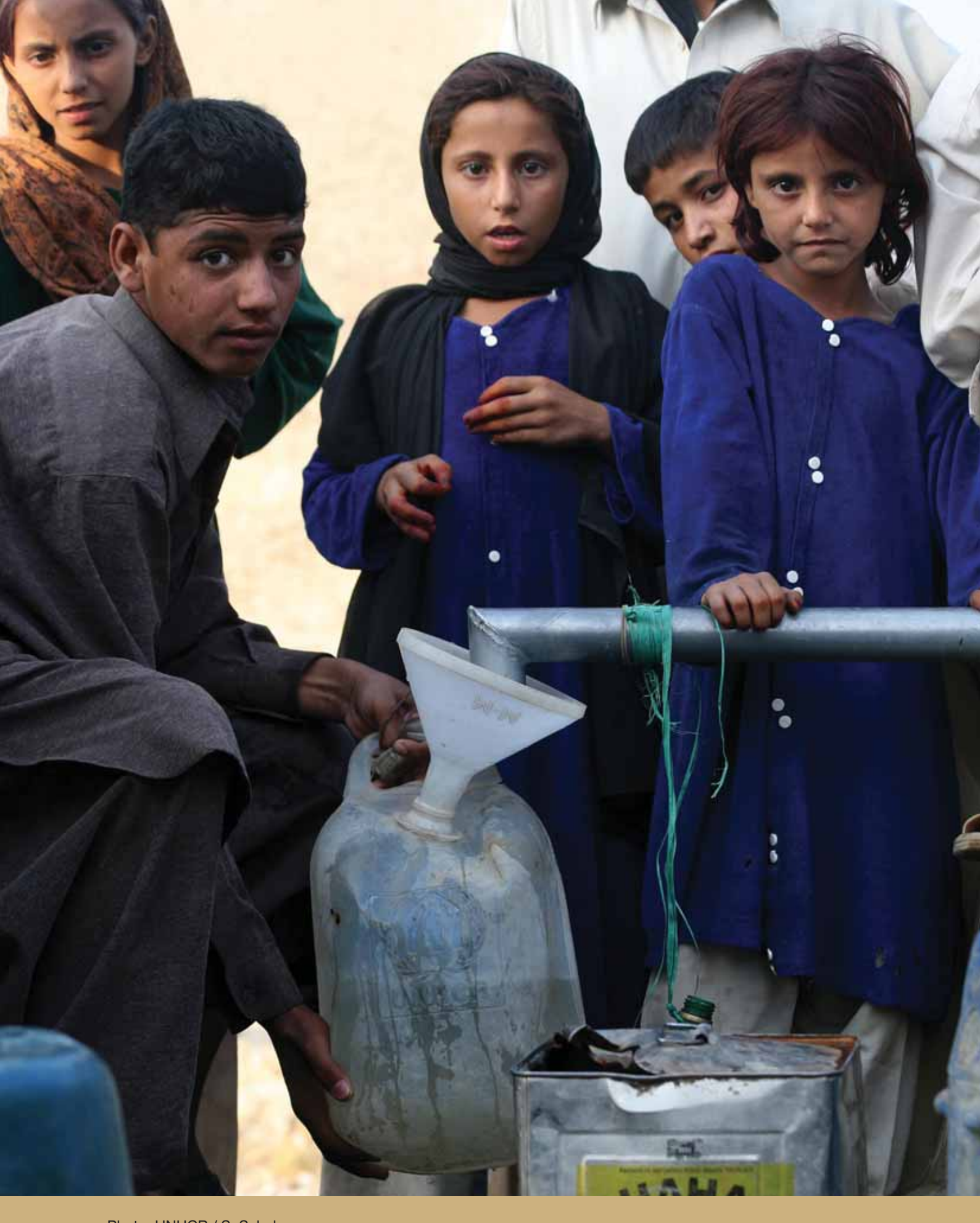
The determination of a child's best interest must also take into account conditions in their home country, their family situation and health