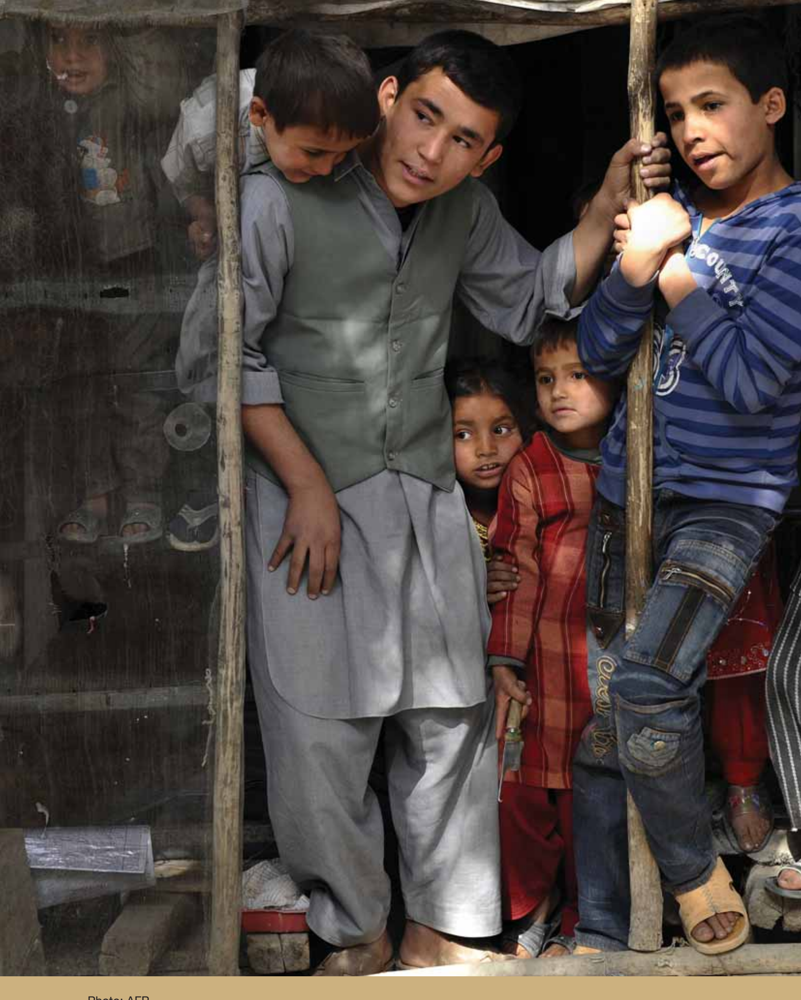
A major problem when evaluating the movement of unaccompanied Afghan children has been the lack of information about their profile