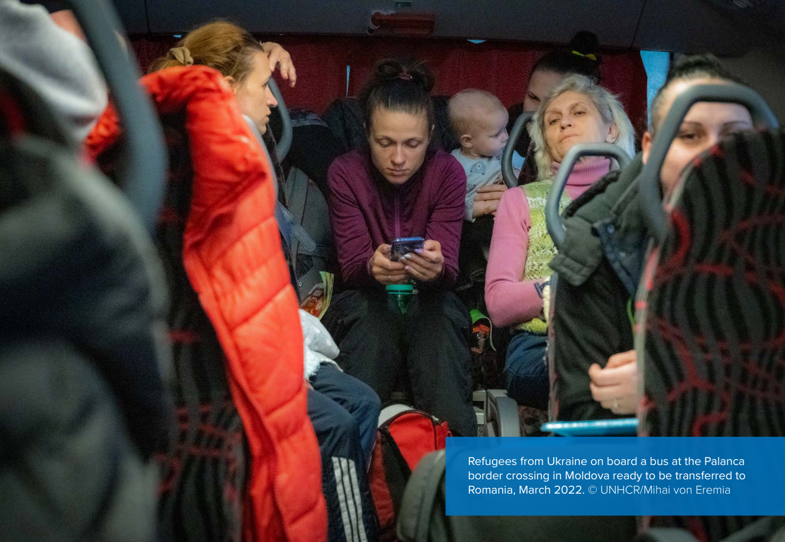
Refugees from Ukraine on board a bus at the Palanca border crossing in Moldova ready to be transferred to Romania, March 2022.