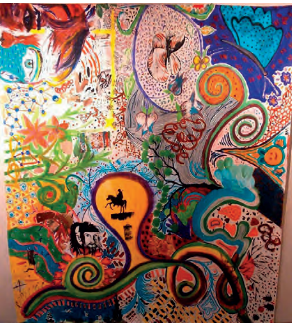
Harmonizing 2 – Collective painting - Seeds of Unity, September 2017

T his chapter takes a deeper look into specific issues related to working with young refugees in a youth work context. It puts forward some challenges concerning both youth workers and/or young refugees. It also provides readers with some concrete tips and ideas on how to tackle the suggested issues.