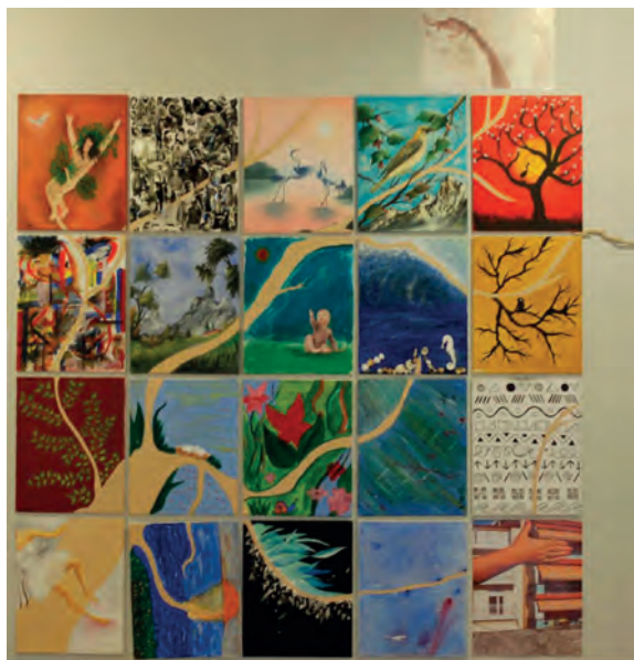
The Tree - Collective Creation - “Seeds of Unity”, September 2017

Intercultural learning cannot be a one-sided process. It is not only about refugees learning to fit in; it is about the “inter-relation”, the creation of new spaces for living together. This, however, can be challenging for youth workers when running their typical youth work activities with young people from different cultures.