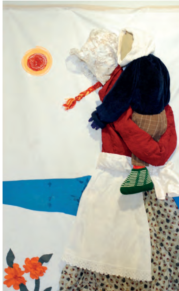
Fractal - Collective Art Piece – "The Art of the Other", July 2017